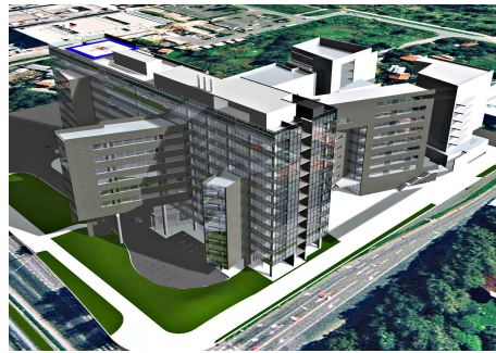
HYPO AAC, Zagreb, 2003. Business complex 85000 m<sup>2</sup>